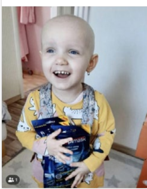
Agátka's genuine joy :-) Give Children with Cancer a Chance Foundation

In Bedřichov on 7 February 2020, the 53rd annual Jizerská 50 cross-country ski race took place. We took this occasion to begin our cooperation with the biggest Czech health insurer, VZP, with the end goal of enabling as many people as possible to buy our products at reduced prices. The coronavirus delayed that cooperation, which did not come into full force until August. Nevertheless, competitors from VZP and VZP's Good Health Club hit the ski trail for the February race in our nanofiber R-shield neck gaiters. These protected them not only from the cold, but also from the risk of infection due to the large concentration of people in the same place.