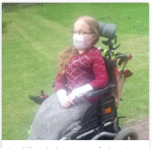
I would like to thank you once more for the respirators you donated. All the patients suffering from spinal muscular atrophy are really happy for them. These kids have trouble breathing even without masks, and your respirators are the only ones that they are able to use for a longer period of time.

This time we arranged discounts for those insured by the VZP Insurance Company. Why VZP? Because they are the biggest healthcare insurer in the Czech Republic, providing coverage for 5,680,000 clients. And our mission is to provide available and quality protection to the greatest number of people possible, in order to end the coronavirus epidemic as swiftly as possible.