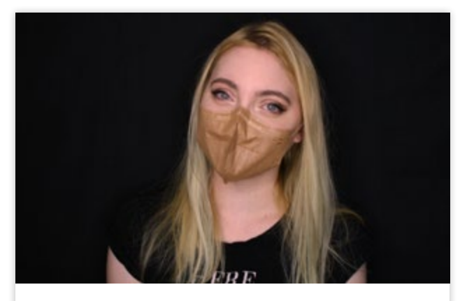
I had a transplant operation and a few weeks ago I came down with a serious case of pneumonia. Sometimes I found it difficult to breathe with a neck gaiter, but the VK respirators almost breathe by themselves. I could barely notice that I had them on. They're comfortable, plus they give me a feeling of safety, like every RESPILON product. I took a good look at this product from all aspects and can find absolutely no room for improvement.