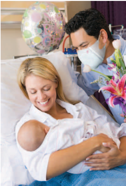
in maternity hospitals

Is your family really protected? Solution: Nanofiber facemask