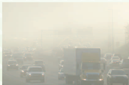
in smoggy conditions