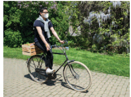
when riding a bike