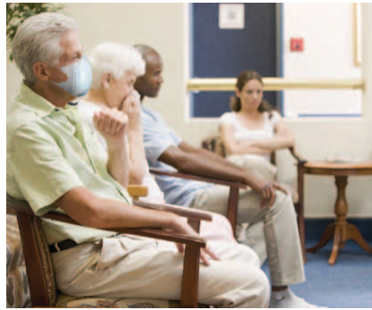
in waiting rooms