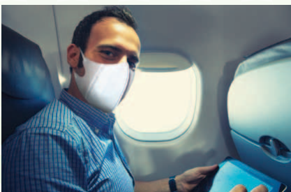
on a plane