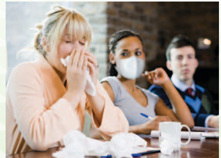
in the office