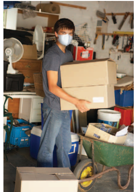
when cleaning up